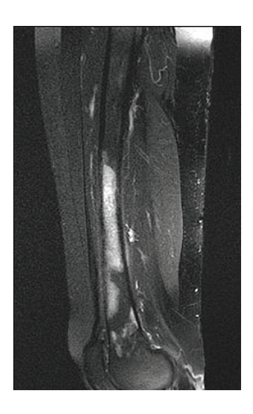
Figure 2. STIR T2-weigted sagittal image shows high signal intensity of the lesions in central and distal part of the right femur