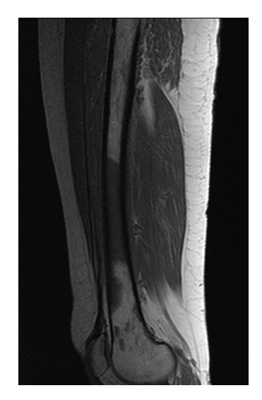
Figure 3. Sagittal T1 – weighted image reveals few low signal lesions in the marrow of the mid and distal femoral shaft without extraosseal soft tissue mass or periosteal reaction